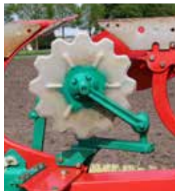
Maize or manure skimmers.