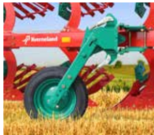
Notched disc or plain disc Ø 18" / 20"