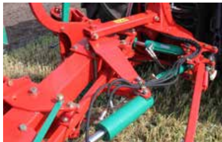
Optional hydraulics with memory system